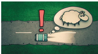
Beware of sheep on the road