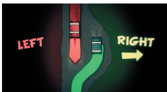
When the turnouts are on your right hand, it is your duty to give way to oncoming traffic