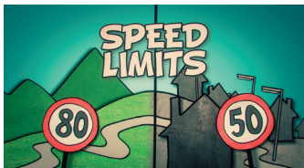
Speed limits on public and municipal roads