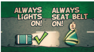
Always keep the lights on and seat belts buckled