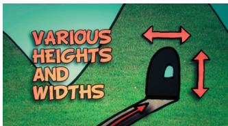
Pay attention to various heights and widths in the older non-standard tunnels