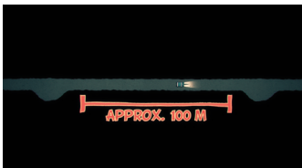
There are approximately 100 m between the turnouts in the old tunnels