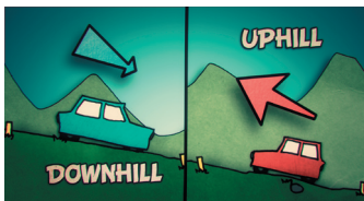
It is always easier for the one driving down the hill to pull into a turnout than for the one driving up the hill